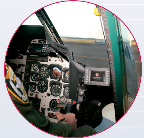
AirVision™ in helicopter cockpit

The system was an immediate success. The Indian River fleet management was so impressed with the durability of the compact flash, solid-state solution, that they outfitted their motorcycles when the